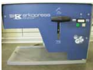
Fig. 7) Thermoforming machine, e.g. Erkopress/Erkodent GmbH