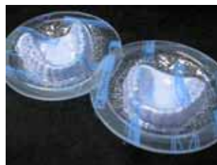
Fig. 6) Models with thermoforming discs. Models should be watered for about 10 minutes if plaster is desiccated.