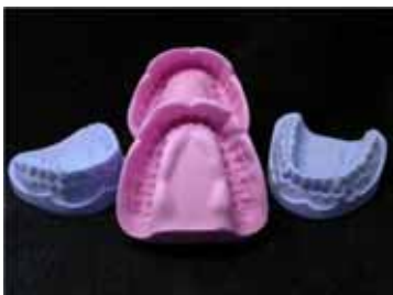
Fig. 5) Duplicated forms (pink) and duplicated models (blue)