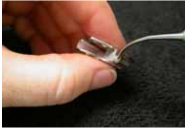
Fig. 11) For protection purposes a wax layer is put on the metal components (i.e. to prevent adherence of polymeric residues at the screw thread.