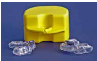
Fig. 15) Mandibular adjustable positioner SomnoGuard AP Pro with storage case