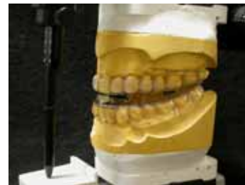
Fig. 14) Finished appliances in the articulator.