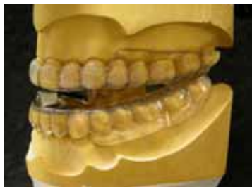
Fig. 13) Fixation of the metal components with crystal clear, cold polymerising acrylic. Recommended primer: Targis Link / Ivoclar Vivadent GmbH. Apply acrylic in the molar area to assure distal support.