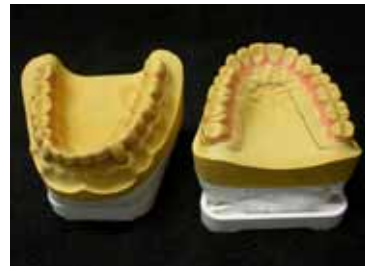
Fig. 4) Models with blocked-out undercuts prepared for duplication.