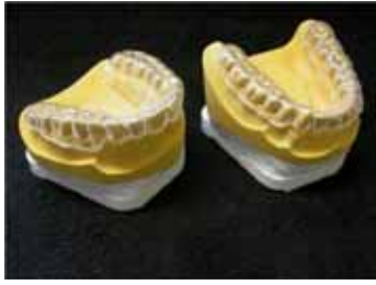
Fig. 9) Completed and polished appliances; to finish thermoforming results we recommend the Finishing-Set Quick from Erkodent containing all needed instruments such as drills, burrs and special scissors.