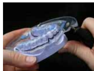
Fig. 8) Appliance under construction. Before starting trimming the thermoform and cutting edges, it is recommended to draw in the boundary lines.