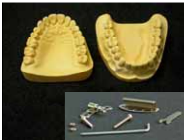
Fig. 1) Master models with stainless steel made attachments to adjust the lower jaw advancement. Incl. adjusting screws, counternut to fix protrusion, socket screw key, counternut key