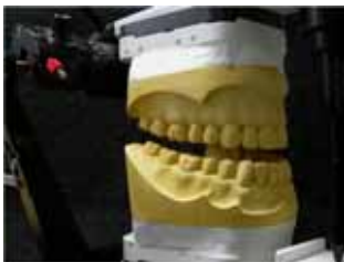
Fig. 3) • Dentist takes construction bite registration, e.g. by using the George gauge, and thereby defines initial protrusion for the lower jaw. • Fabrication of a plaster grade 4 quality model by a dental lab. • Use average movement articulator to establish construction bite.