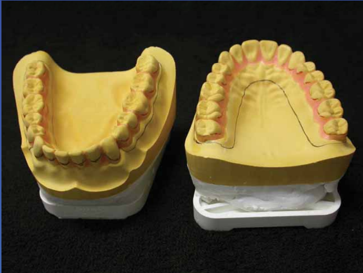
Models with blocked-out undercuts prepared for duplication.