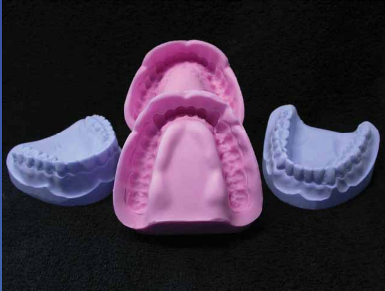
Duplicated forms (pink) and duplicated models (blue)