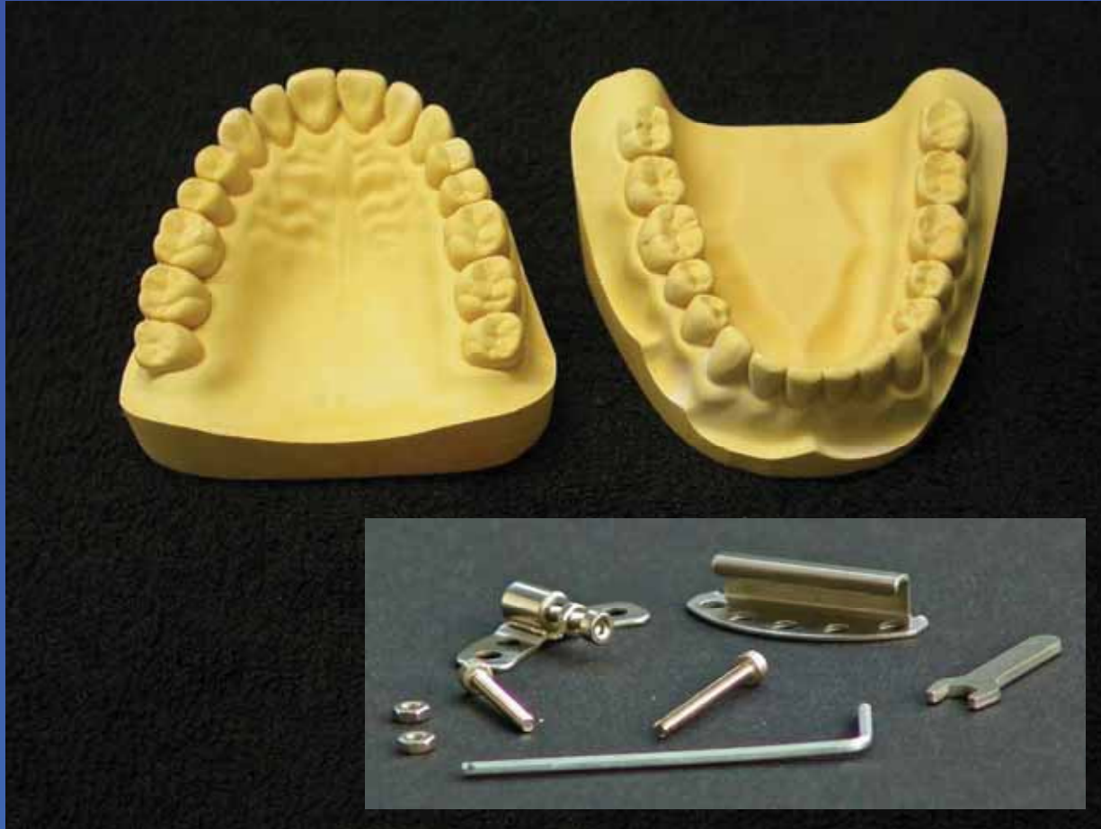
Master models with stainless steel made attachments to adjust the lower jaw advancement. Incl. adjusting screws, counternut to fix protrusion, socket screw key, counternut key