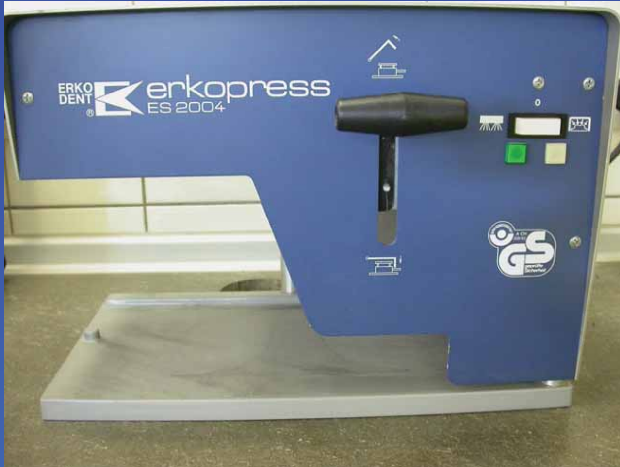
Thermofforming machine, e.g. Erkopress/Erkodent GmbH