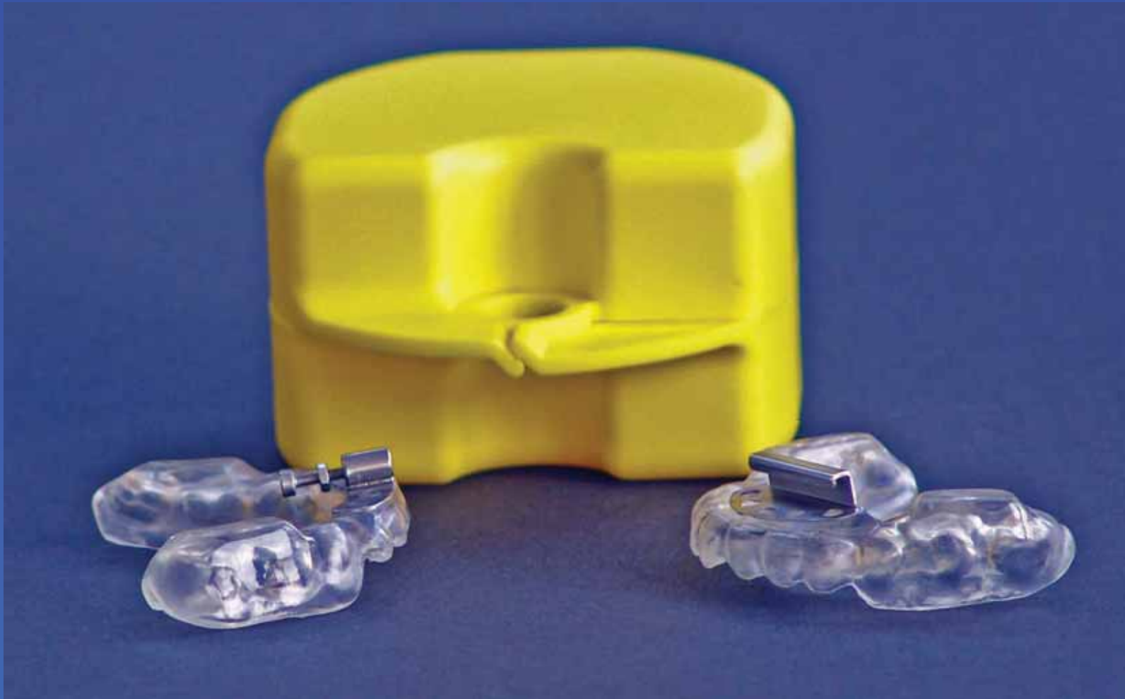
Mandibular adjustable positioner SomnoGuard AP Pro with storage case. The protrusion can be fixed with a counter nut.