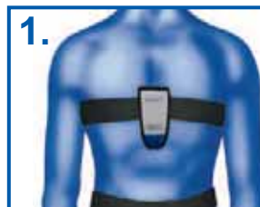
SleepDoc MiniPorti with chest belt