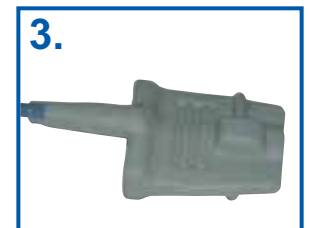
The reusable HP SpO2 finger sensor is durable and comfortable for the patient.